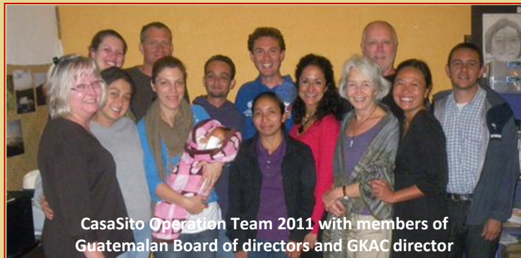
CasaSito Operation Team 2011 with members of Guatemalan Board of directors and GKAC director